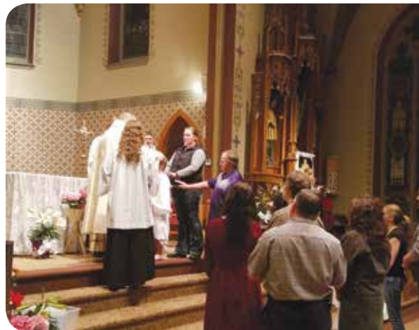
The girls are excited to be Catholic and to share God’s love with others.