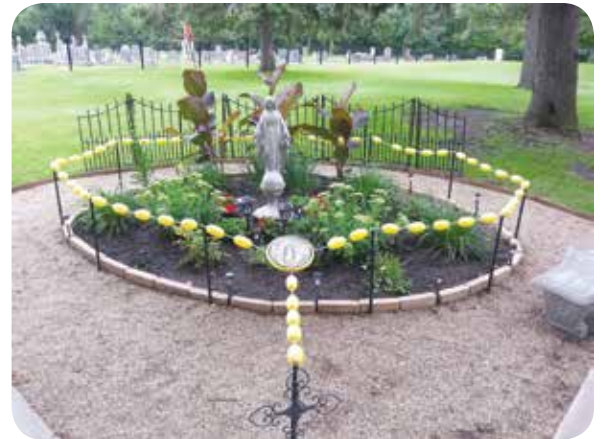
The Rosary Garden at St. Alexius Church