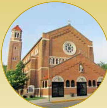
Our Lady of the Angels